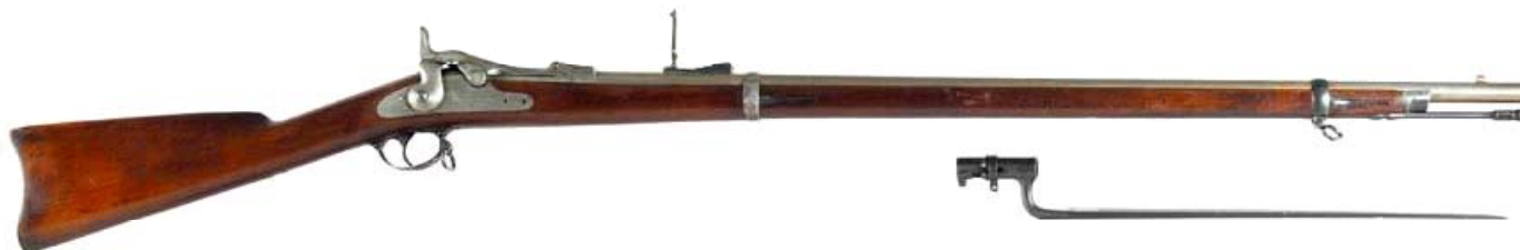
Springfield Trapdoor Rifle

Alamo Area Moderators - Rescheduled Monthly match to (Saturday) Nov 25th Star Christmas - Tin Star Ranch - Dec Dec 2 nd - 4 th