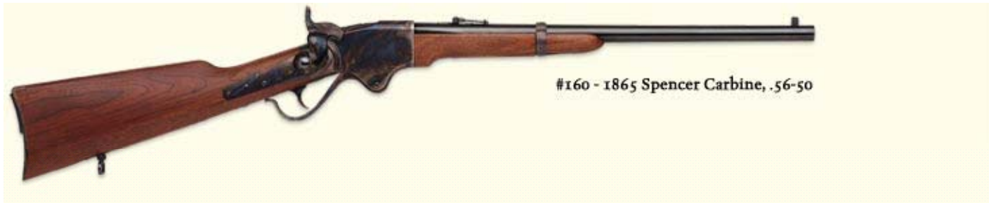
#160 - 1865 Spencer Carbine, .56-50