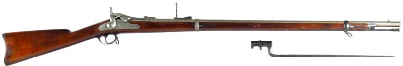
Springfield Trapdoor Rifle